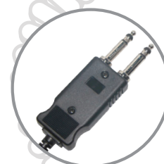
Device: PJ-7 (2 prong plug )