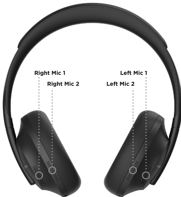
Dual beamforming voice microphone array

Speak confidently and be heard clearly on conference calls — an adaptive four-microphone system isolates your voice from surrounding noise, eliminating the mute/unmute shuffle and “... are you there?” struggle