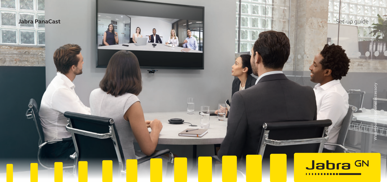
Wall mount is optional accessory